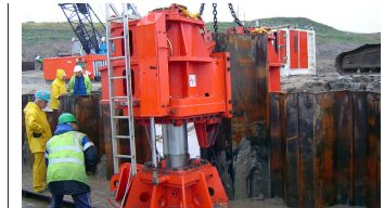
Specialist Work >